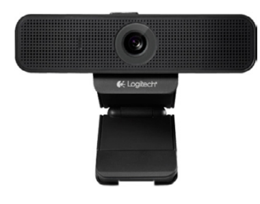
Figure 35. Logitech Webcam C920-C Supports the Cisco DX600 Series as an LCD-mounted camera, Support for HD Video Collaboration

<u>Turn Traditional</u> <u>Telephones into IP</u> <u>Endpoints</u>