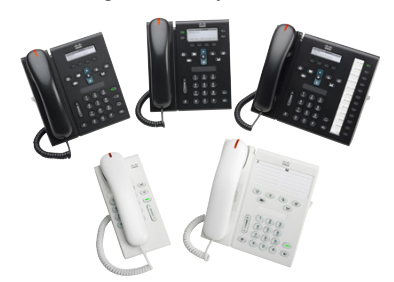
IP Phones 6900 Series

Figure 2. User-friendly, Eco-friendly, and Budget-friendly