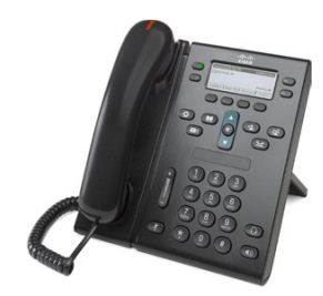
IP Phone 6945

<u>General Business</u> <u>Communications</u> <u>Endpoints</u>