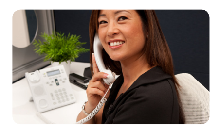
IP Phone 6941

Figure 6. Moderate Communications, Easy to Use, and Powerful