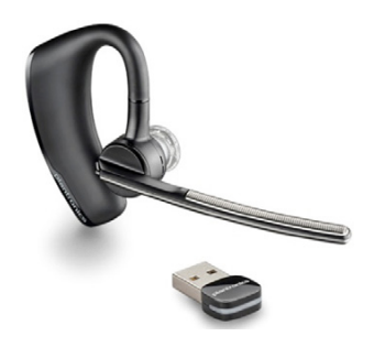
Figure 33. The Voyager Legend UC Is Almost a Personal Assistant

Turn Traditional Telephones into IP Endpoints